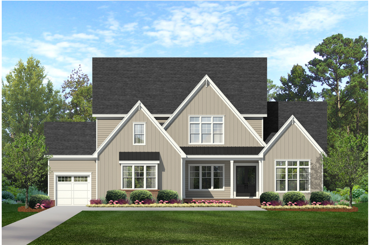
Hayes Barton Homes, Homesite 39 - 4,220 SF 3161 Mantle Ridge Drive • Apex, NC 27502