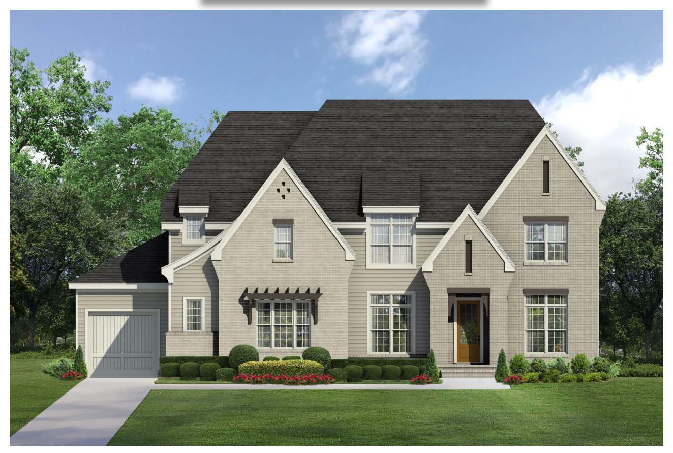
Future Homes by Jim Thompson, Homesite 102 - 3,923 SF 1860 Elderbank Drive • Apex, NC 27502