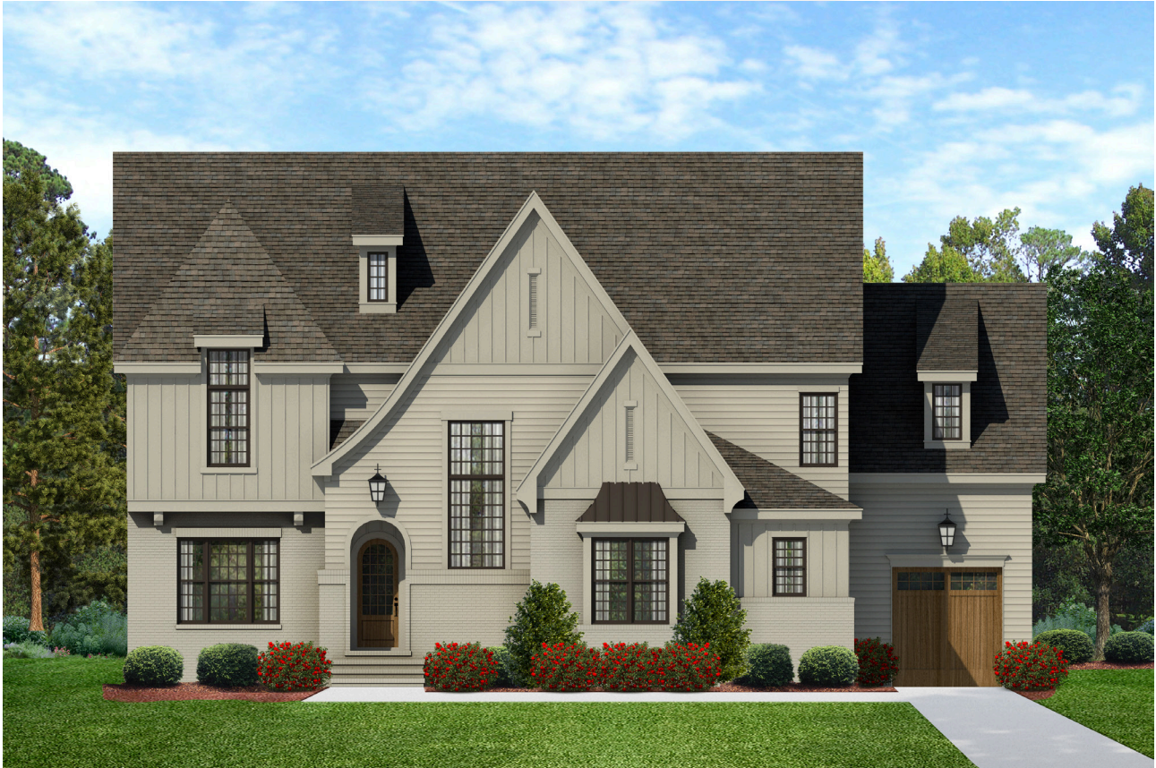
Gray Line Builders, Homesite 77 - 4,877 SF 1847 Elderbank Drive • Apex, NC 27502