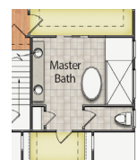
OPTIONAL MASTER BATH

SALES INFORMATION 919.249.6162 | 1832 OLD EVERGREEN DRIVE | APEX, NC 27502 | STILLWATERAPEX.COM